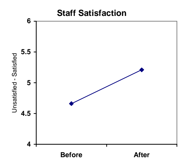
Figure 1: Mean Staff Satisfaction Before and After Refurbishment

To provide a measure of overall staff satisfaction, items measuring before refurbishment variables were summed, as were those measuring post refurbishment variables.