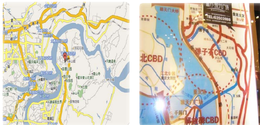
Figure 3 – The locality map of R&F Modern Square, Chongqing