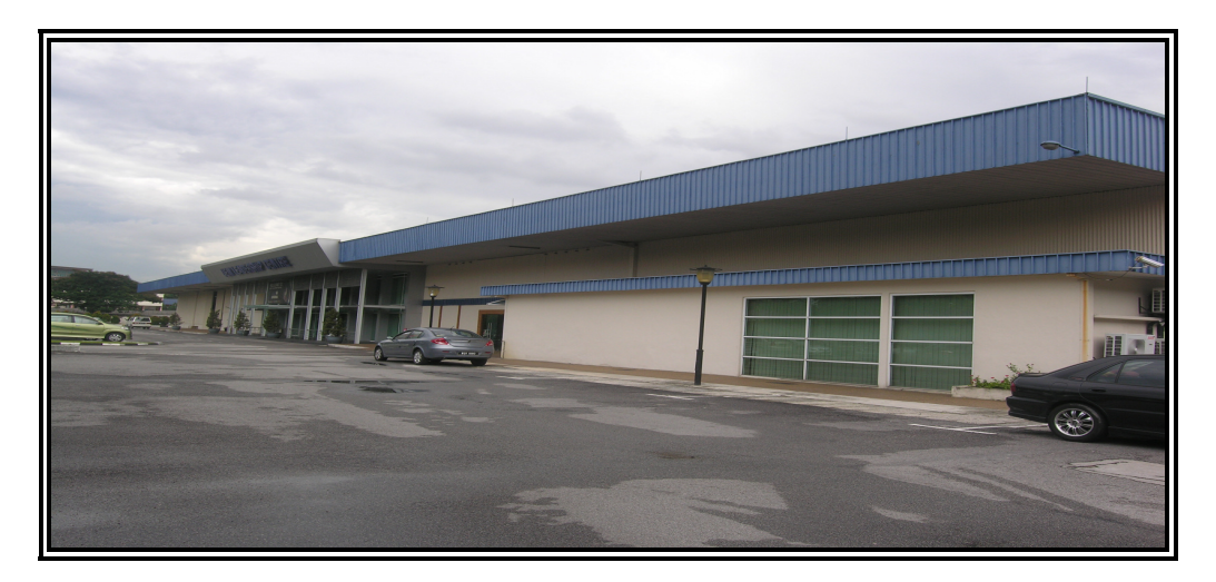
Figure 1: Photo of ULC site (formerly a Warehouse)