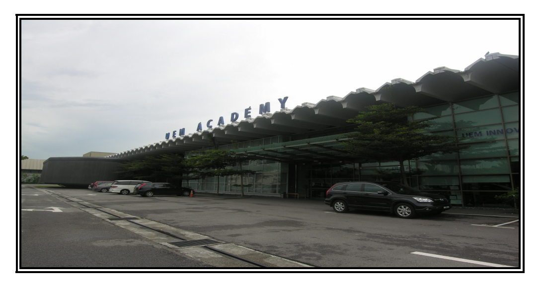
Figure 2 : Photo of UEMA site (formerly an Automotive Workshop)

The location of the subject property is within the industrial zone of Section 51 in Petaling Jaya with its entrance fronting Jalan 51/217 and Jalan Templer on its southern side. It is a second layer lot from the Federal Highway.