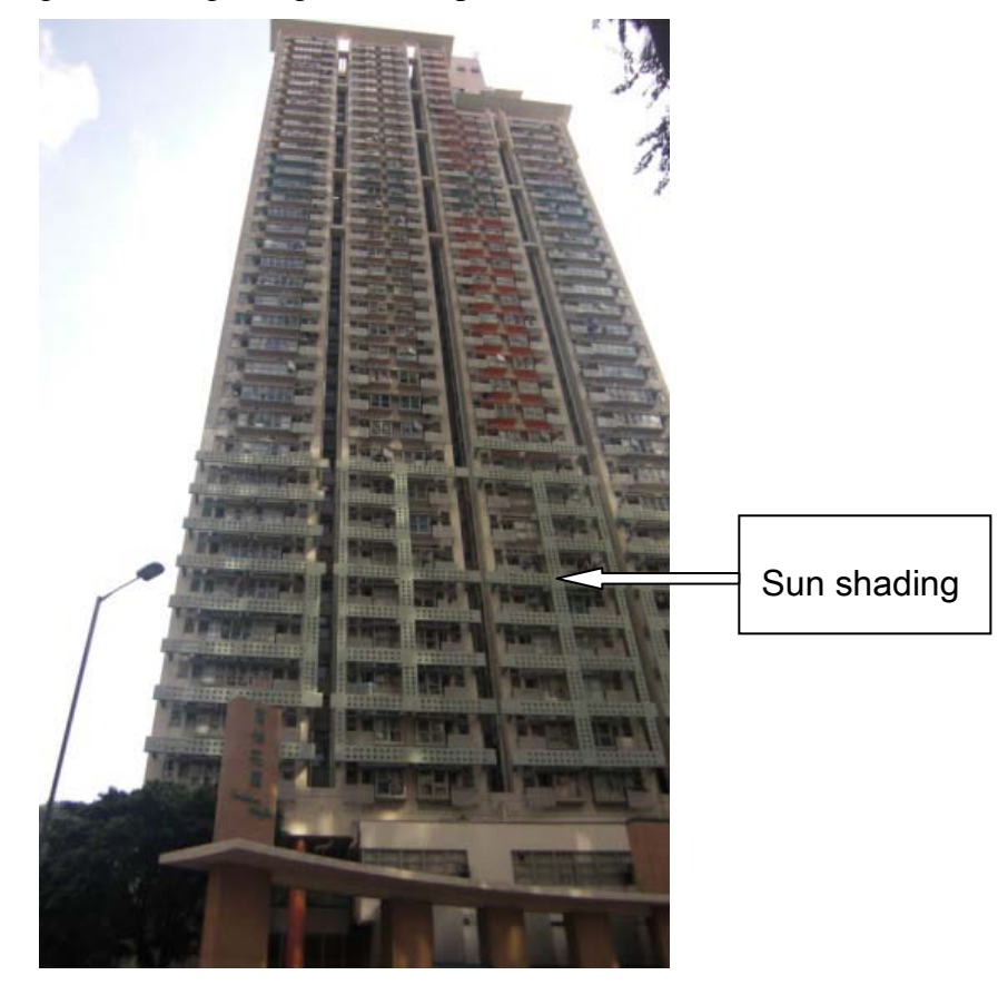
Figure 1 Verbena Heights in Hong Kong.

In Dubai, escalators must be fitted with controls to reduce speed or to stop when no traffic is detected in new buildings. The average lighting power density for the interior connected load must be no more than the watts per square meter of gross floor area. The maximum watts per square meter