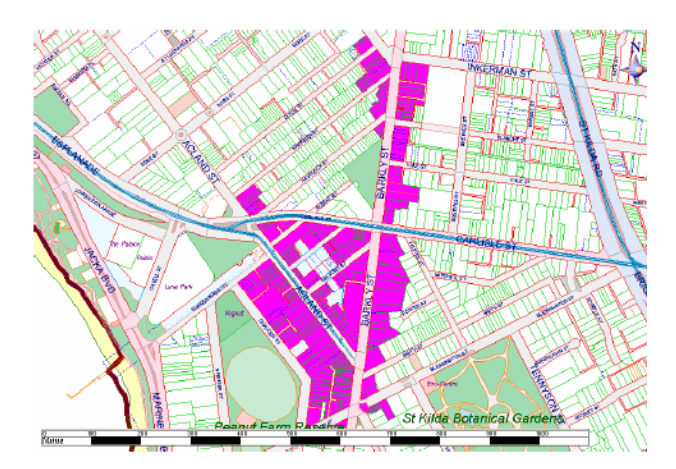
Diagram 3: Acland St Commercial Precint (SGS, 2006, p.28)

The case study of Acland Street in St Kilda is an example of a traditional shopping district that is one of the most distinctive areas within inner regional municipalities. It services multiple users including local residents, tourists of various age groups with major influxes of tourists during the summer months. In addition, Acland Street contains both major supermarkets and contains single lane vehicular traffic with a tram lane containing a terminus at the end of the street. The majority of business uses along Acland Street comprise of hospitality and service sector uses. Based upon ABS 2001 census date (cited in SGS, 2006, p.28) the hospitality and services sectors accounting for $39.8m of $110.3m retail turnover in 2001(SGS, 2006, p.28).