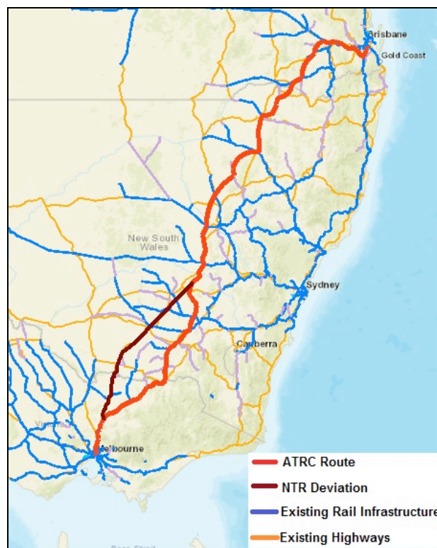
Figure 1, Overview of Inland Rail project

An overview of the proposed Melbourne and Brisbane rail project (Inland Rail) is represented in Figure 1.