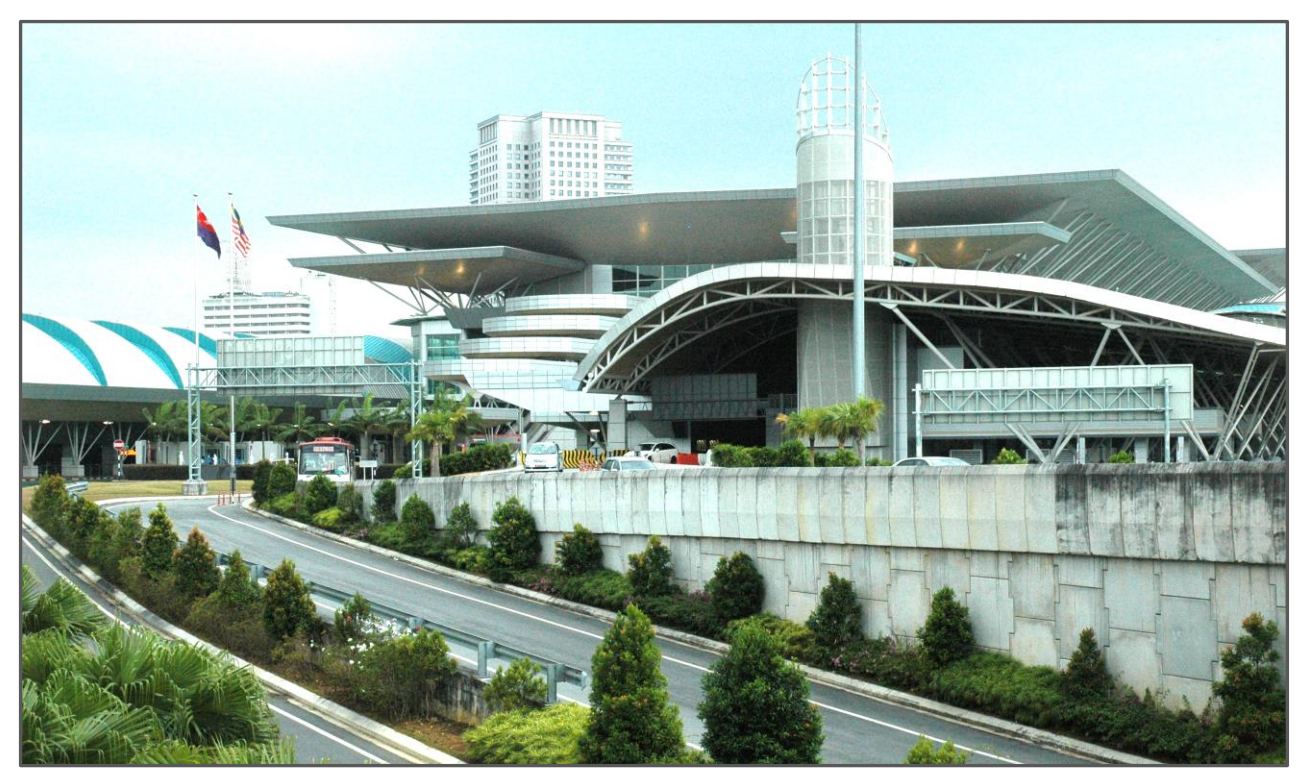
Figure 1. General view of the CIQ Complex

As a transportation terminal asset that links comprehensive infrastructure of highway and bridges, the CIQ Complex are the case study of this research. Further investigation on the facilities provided and the tangible and intangible factor that influence to value are identified.