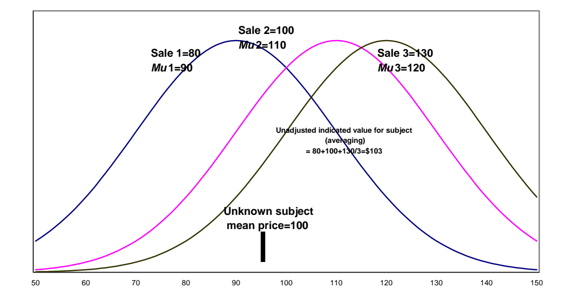
Figure 2 Three sales and their possible price distributions

price distribution of the subject property.<sup>7</sup> We observe only the sales prices. The sketches of distributions, however, make the point that the observed prices are drawn from distributions and that sales probably do not occur at the expectation of the unobserved possible price distribution. After adjustments using a price differences model, the three sales come closer to "telling the same story" about the subject property price (Figure 3). But the three "indicated values" for the subject are still not identical. A valuer would "reconcile" the three indicated values, thereby merging them into a single estimate of the mean of the subject property's possible price distribution. The subject price is a probability distribution of a random variable. The valuation should therefore be a density forecast, not a point forecast.