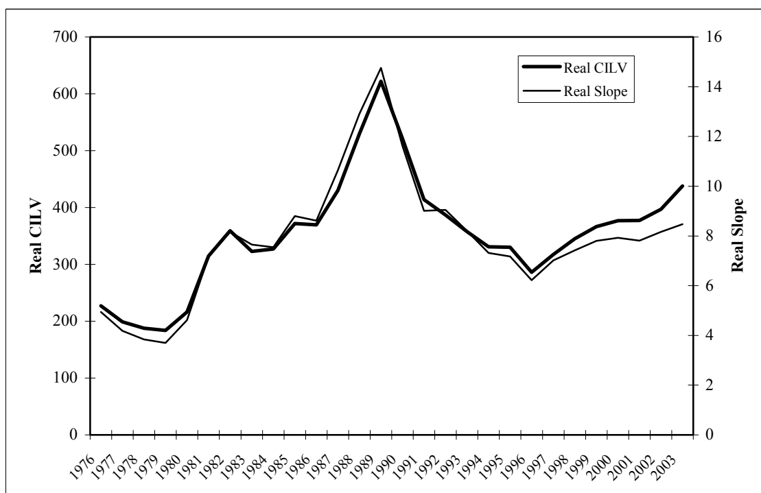
Figure 2: Real CILV and Real Slope in Sydney Industrial Property Market (base year = 1990)